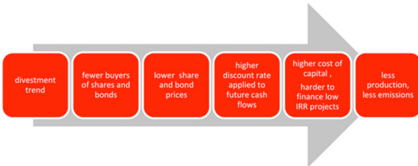
Figure 1 How divestment works. HSBC believes that the divestment movement “could end up hitting fossil fuel companies, putting their projects into a financial stranglehold. .... Less demand for shares and bonds ultimately increases the cost of capital to companies and limits the ability to finance expensive projects, which is particularly damaging in a sector where projects are inherently long term.” 10